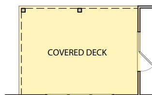
Opt. Covered Deck