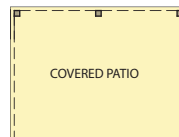
Opt. Covered Patio