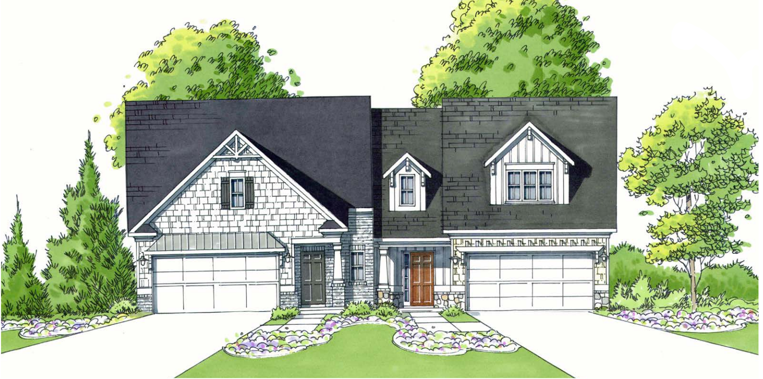
Oak Elevation BB