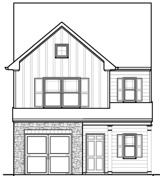
FRONT ELEVATION "C"