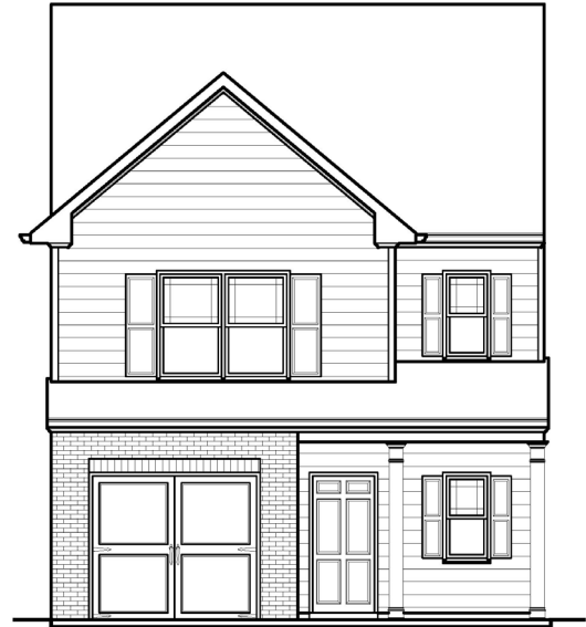
FRONT ELEVATION "B"