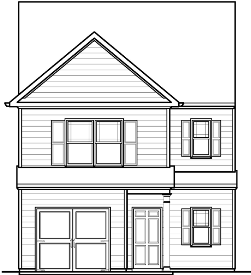
FRONT ELEVATION "A"