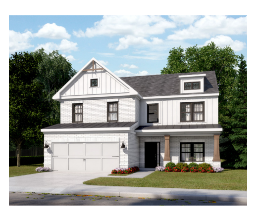
Elevation BB Elevation CC Elevation FF (FH)

*Information believed accurate but not warranted. All drawings and elevation renderings are artistic representations only. Floor plan details & final decisions to be made by Kerley Family Homes. This document is for informational purposes only and is subject to change without notice. Please contact onsite agent for details regarding availability, lots and options. Updated 3/3/22.