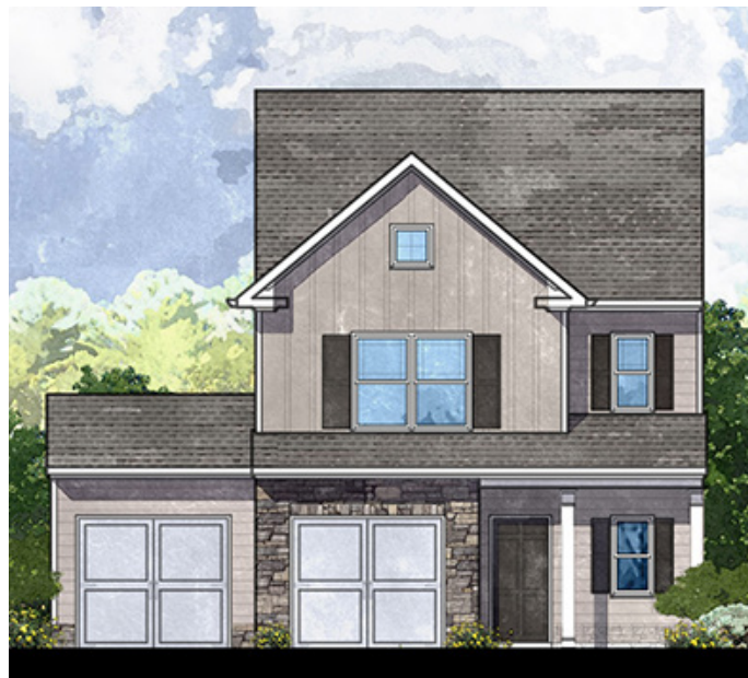
FRONT ELEVATION C